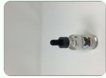
The photos on this report are of a sample collected by the lab and may vary from the final packaging.